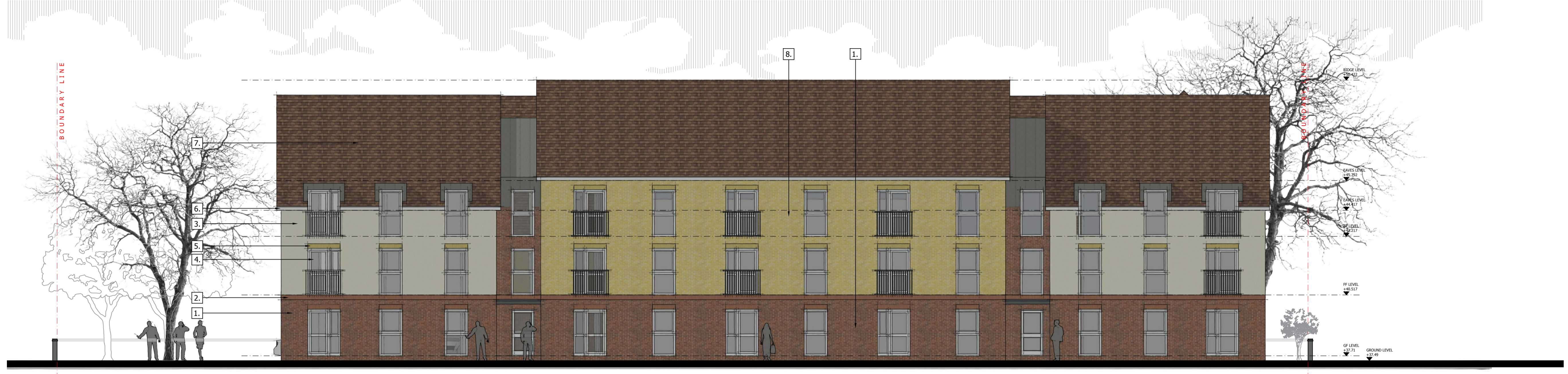
PROPOSED NORTH ELEVATION SCALE 1:100 @ A1