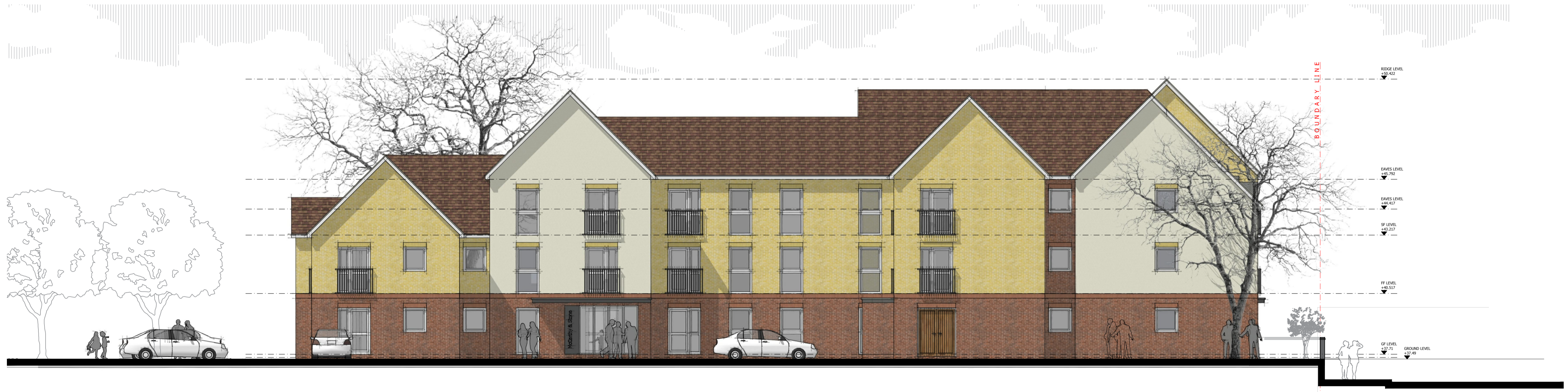
PROPOSED EAST ELEVATION SCALE 1:100 @ A1