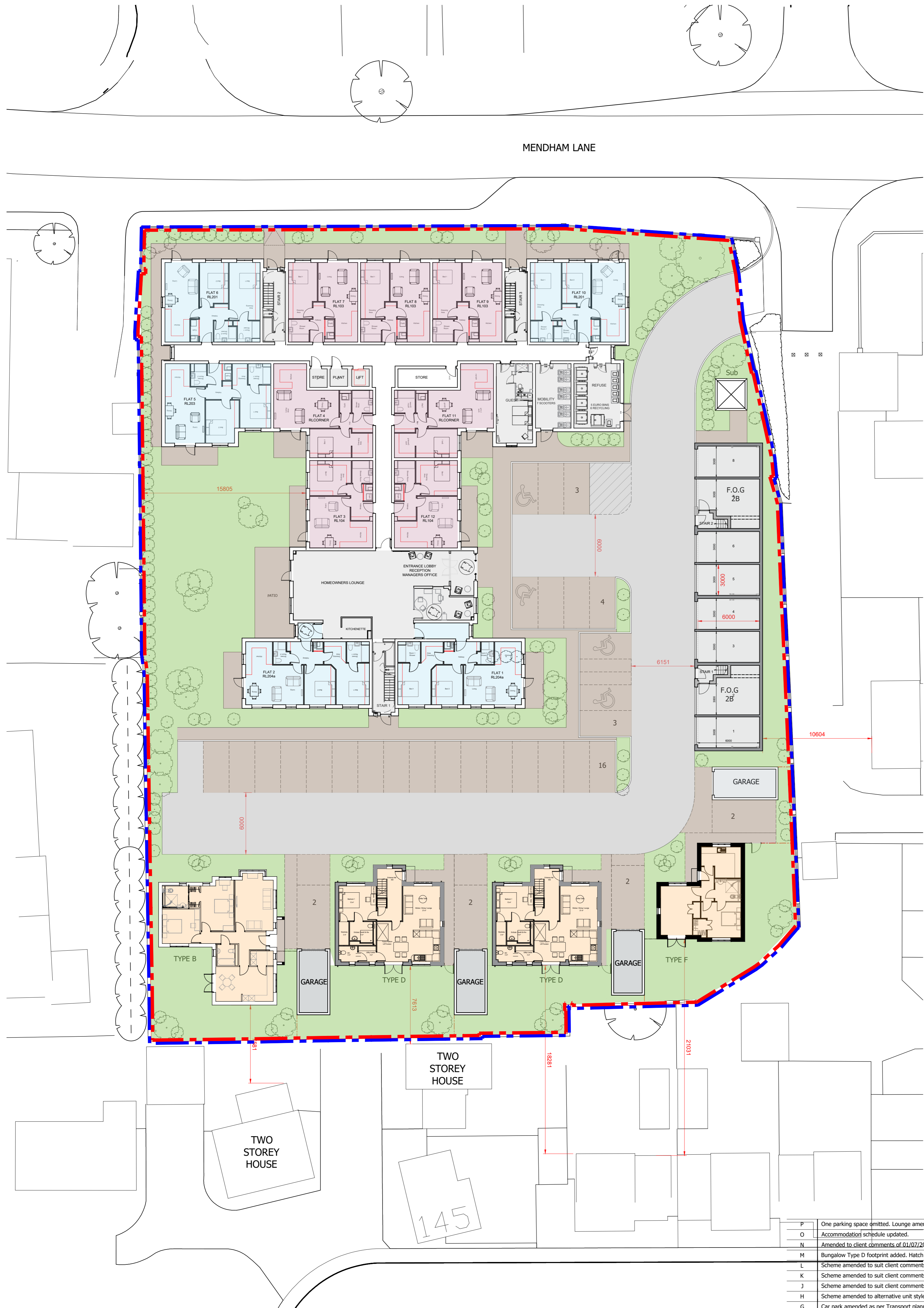
PROPOSED SITE PLAN SCALE 1:200@A1