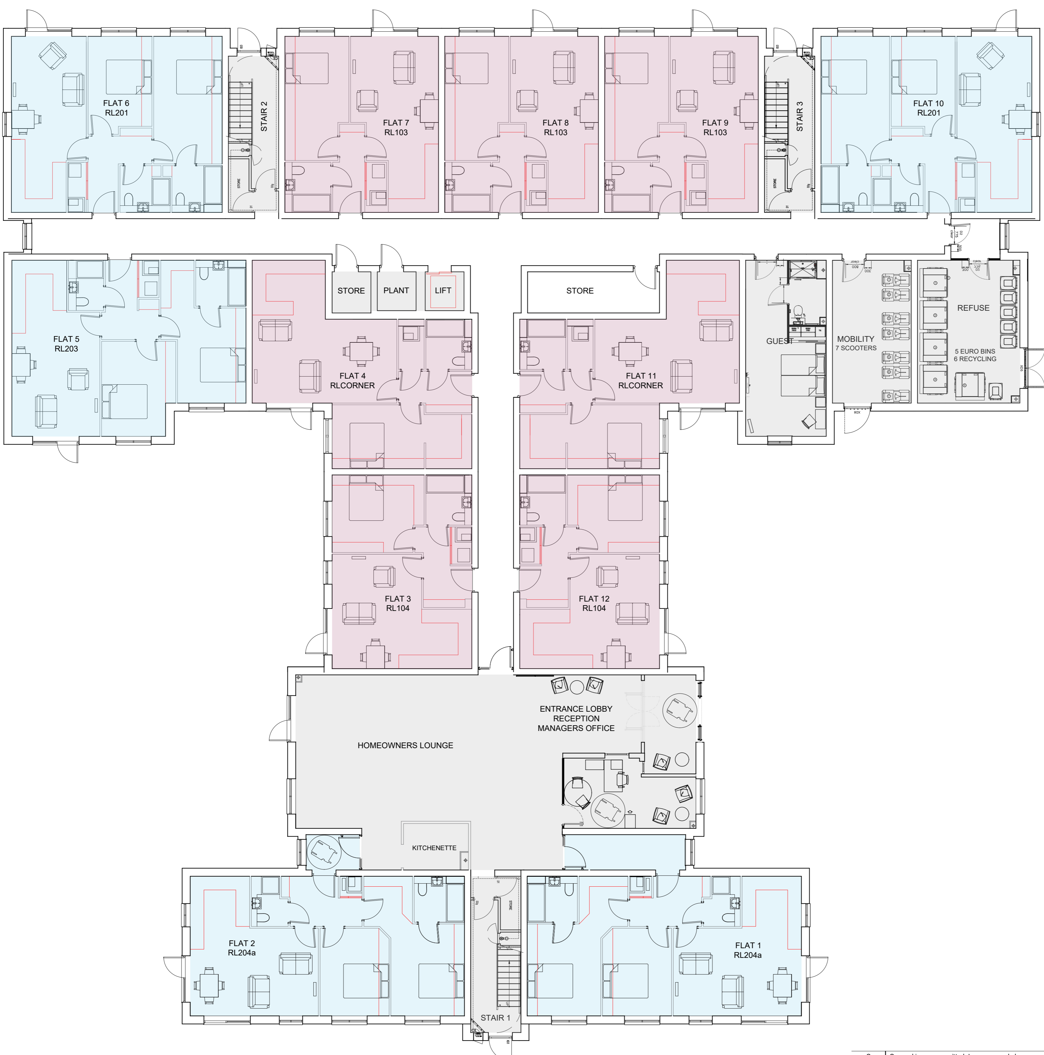
PROPOSED GROUND FLOOR PLAN SCALE 1:100@A1