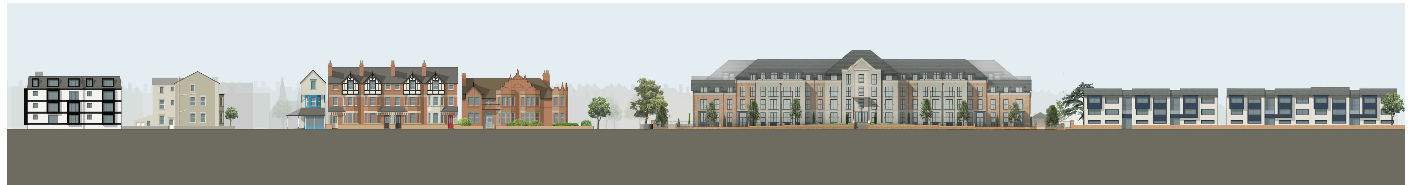
Gloddaeth Avenue Context Elevation AA