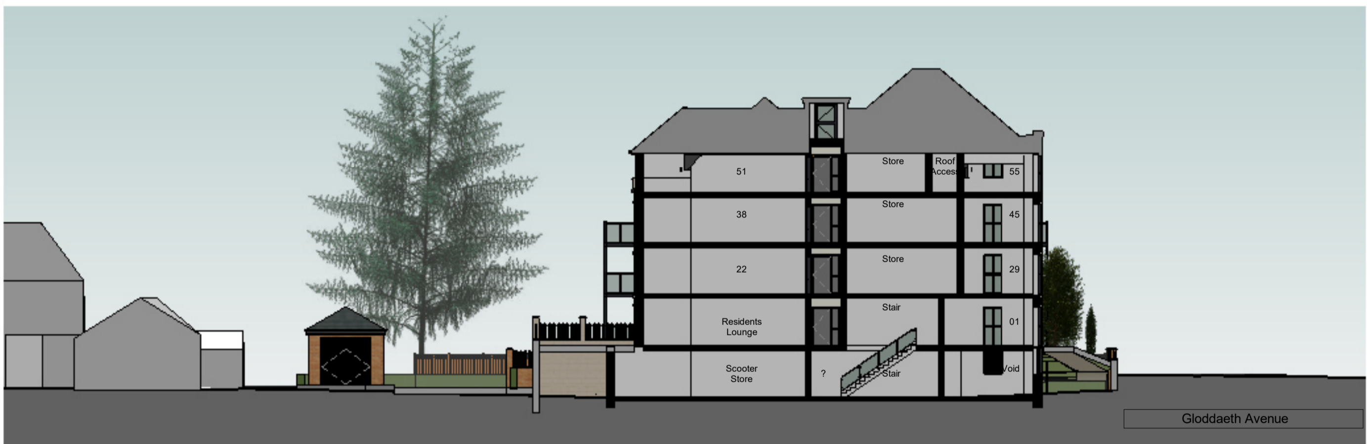
Section 02 1:200