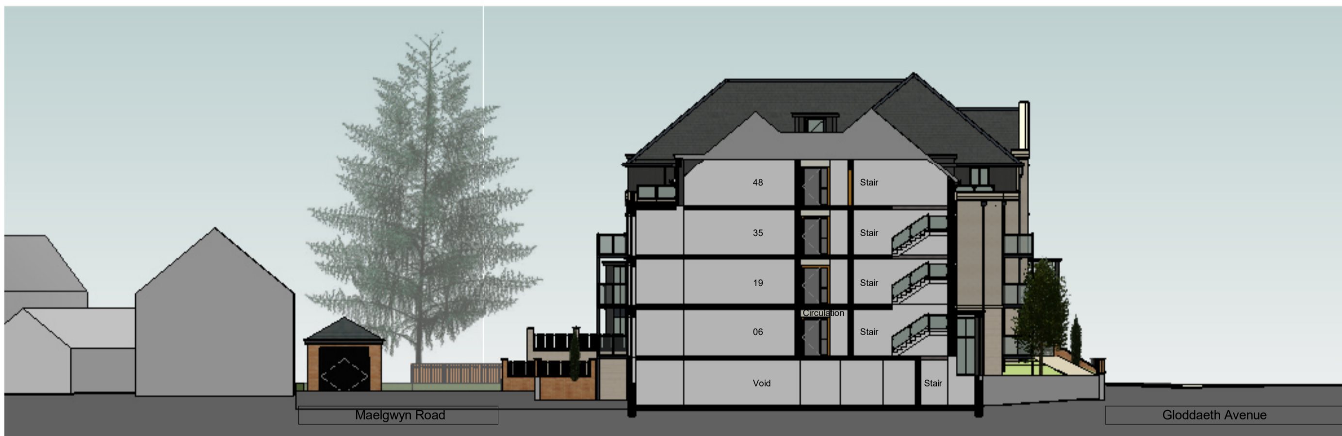
Section 03 1:200