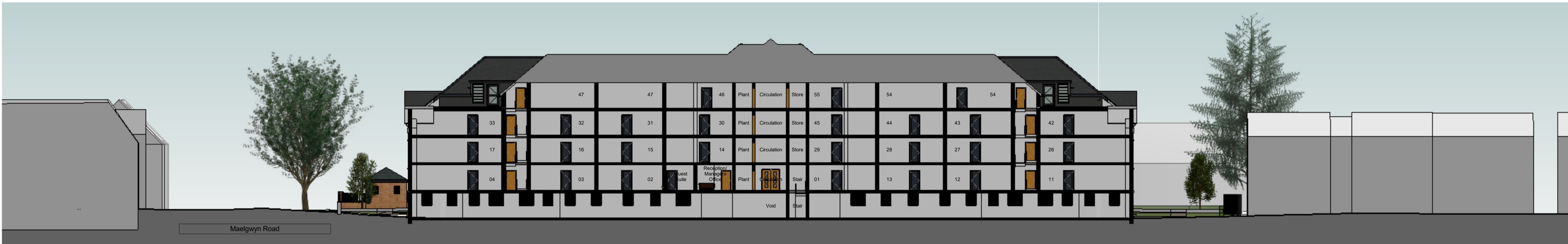
Section 01 1:200