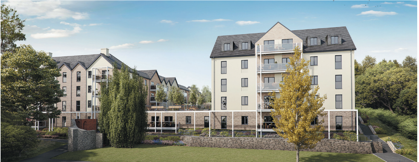
Indicative CGI of the proposed development