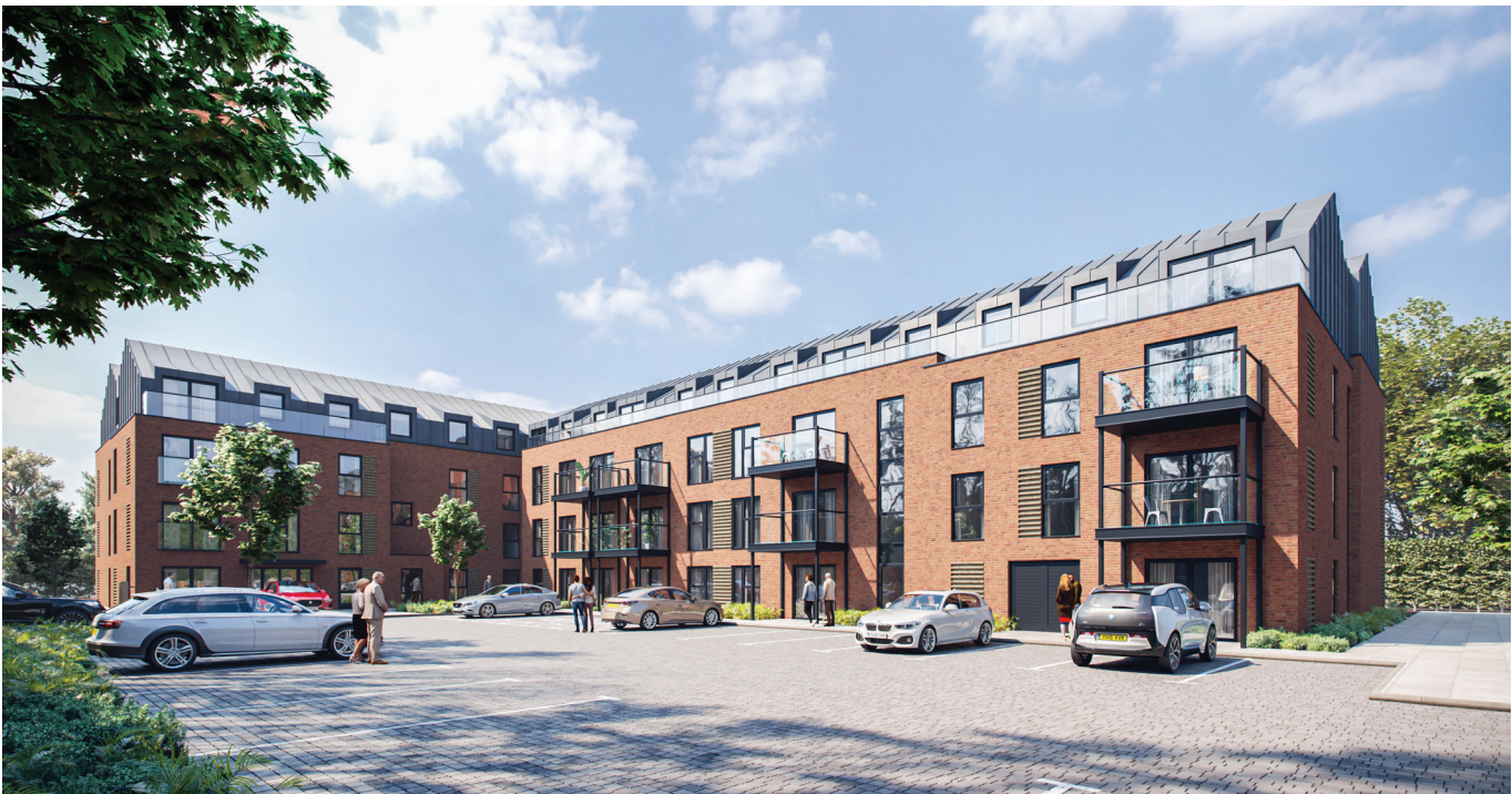
View from site entrance

All estate management is provided in-house by McCarthy Stone.