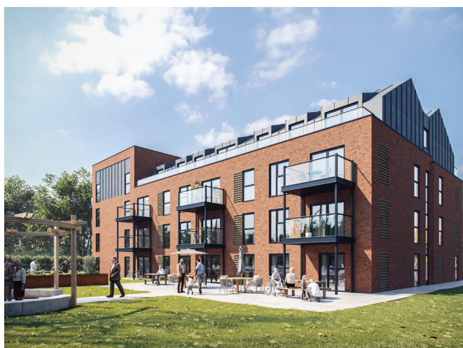
View from rear of ambulance station