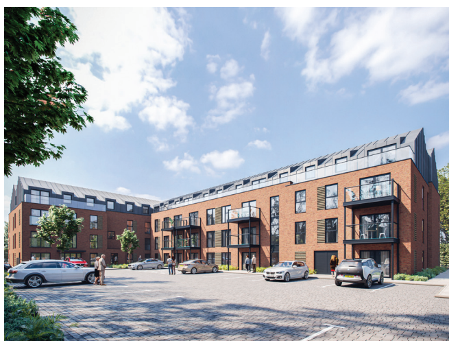
View from site entrance