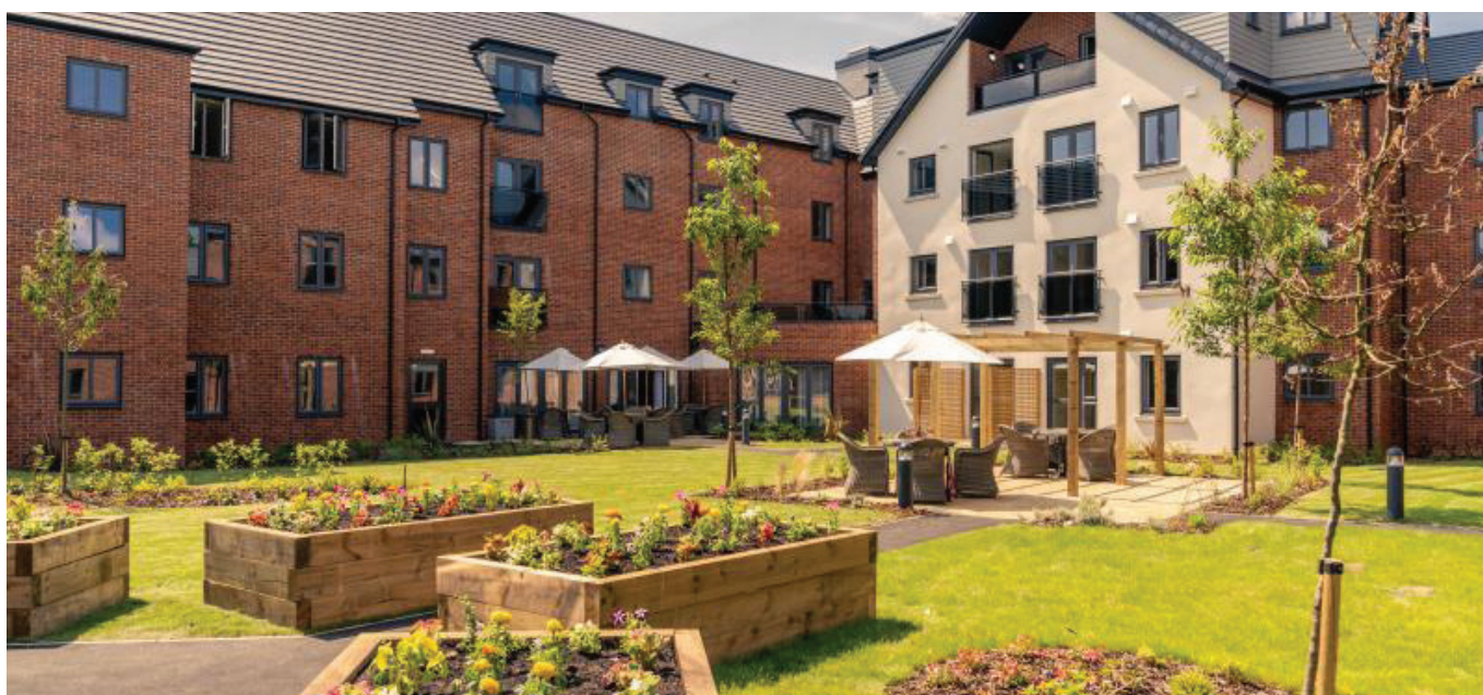
Example of McCarthy Stone gardens at Balshaw Court, Leyland