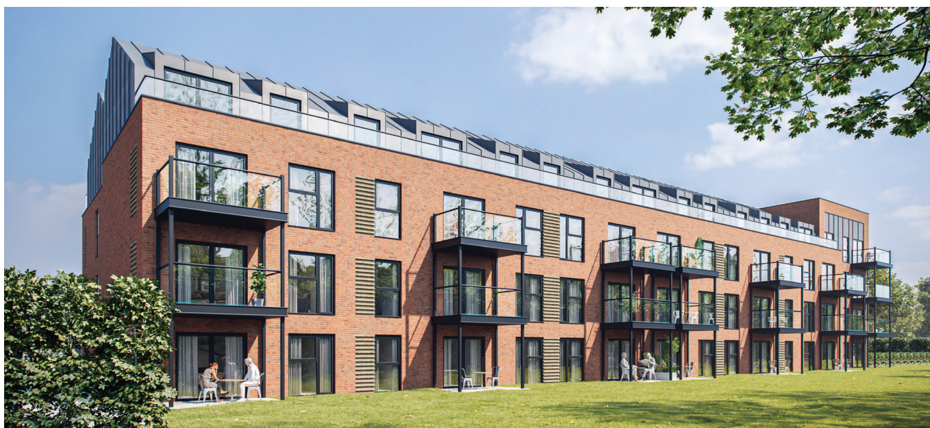
View from Little Lindow

We have carefully considered our design, to breathe new life into a previously developed site. Our proposals present an exciting opportunity to bring forward high-quality, low maintenance homes in a vibrant town, whilst providing genuine choice for older people so they can continue to live locally in a home that meets their needs and aspirations in their later years.