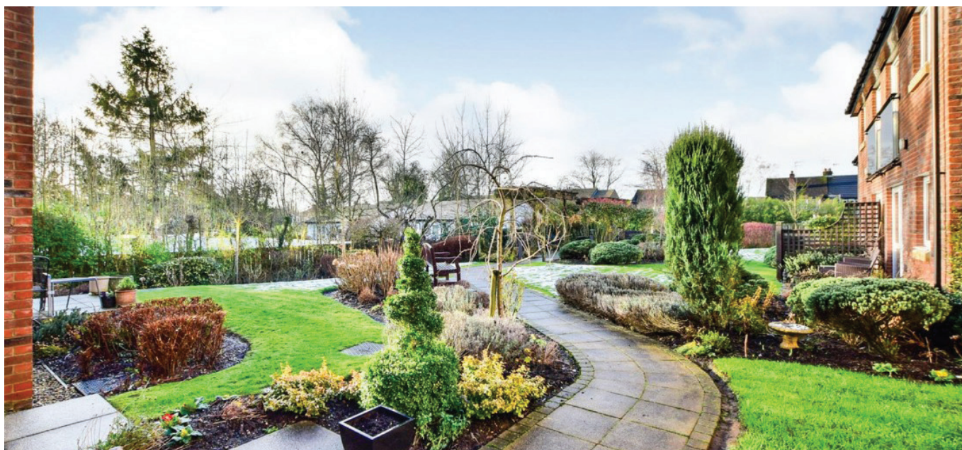
Example of McCarthy Stone gardens at Hanna Court, Handforth

Our own management company will maintain the grounds on behalf of our residents to ensure they develop and mature to enhance both the building and the local neighbourhood.