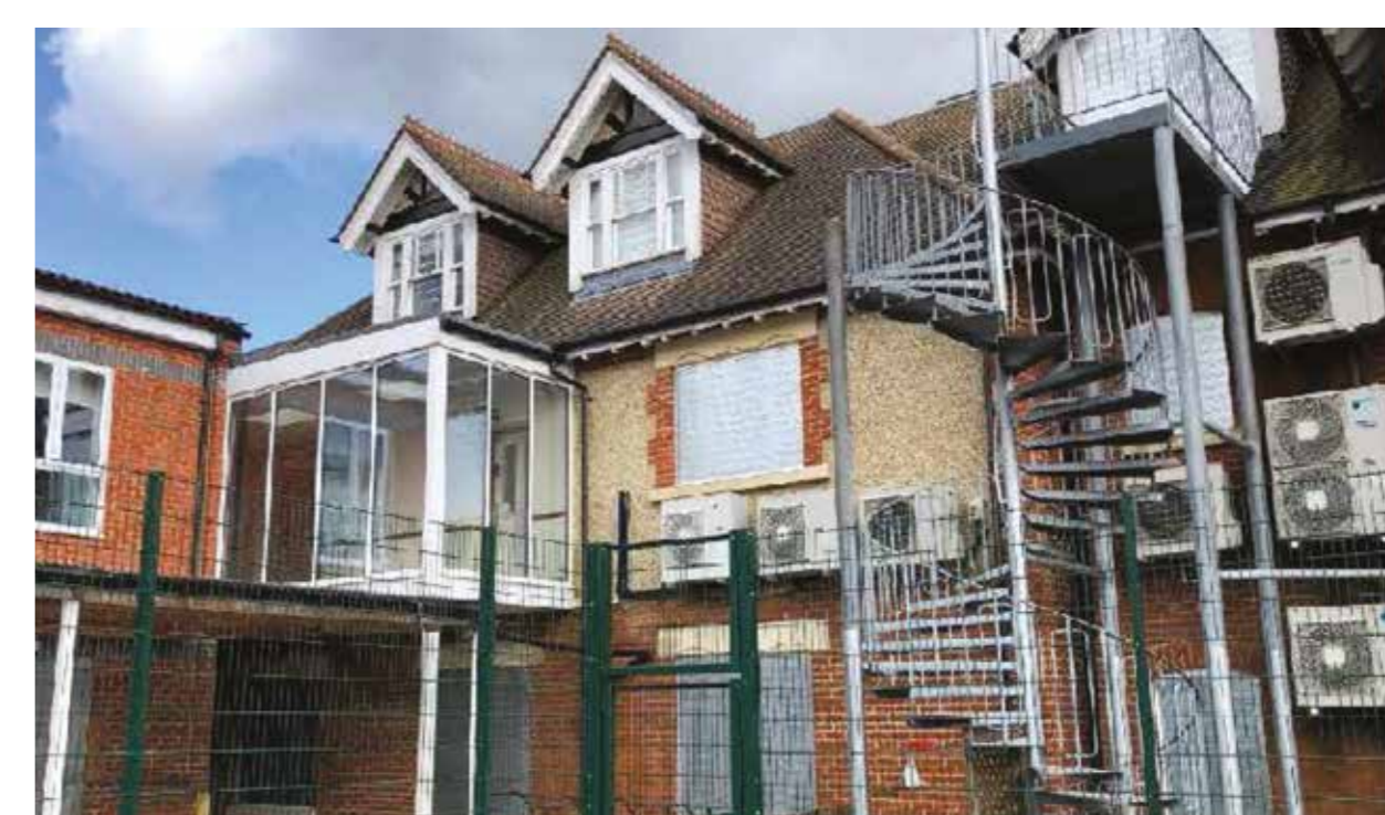
Existing site images