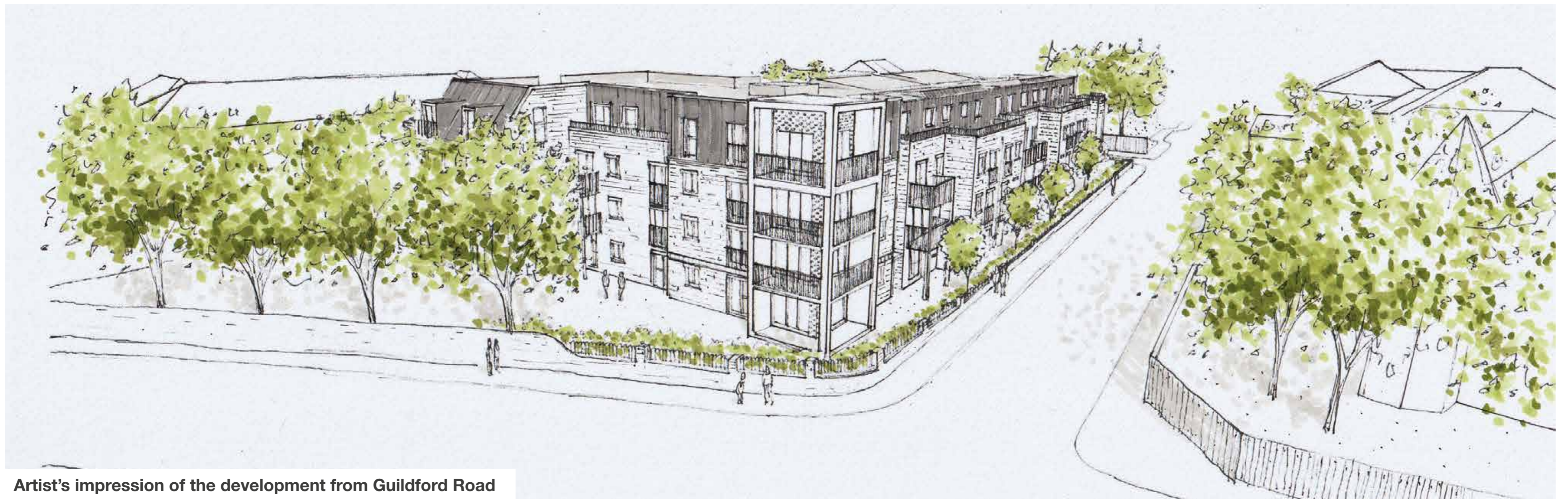
Artist's impression of the development from Guildford Road